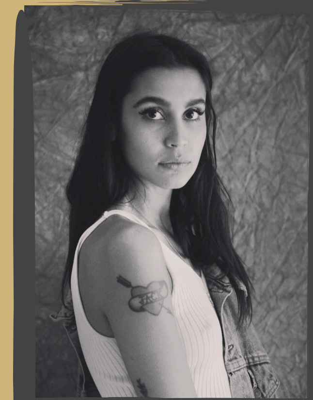
**SOPHIA ALI "BELLE"