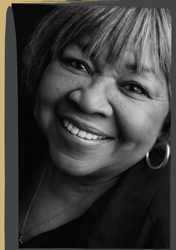
**MAVIS STAPLES "JUDY"