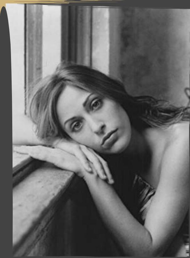
*SUMMER PHOENIX "LOUISE"